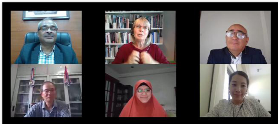
IRSPBL2021 opening session