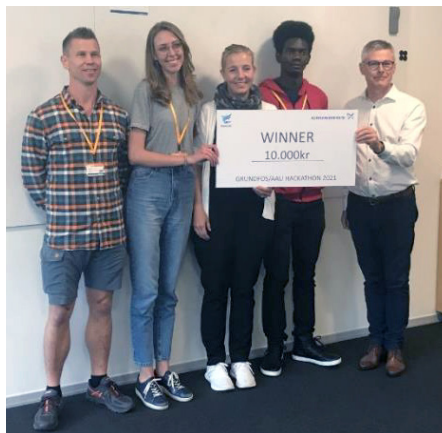
Winning group, AAU Hackathon 2021

Overall, the students found the experience very useful. They appreciated having the opportunity to collaborate with a company and work through complex and challenging problems. The Hackathon is a novel way of involving companies in interdisciplinary work at Aalborg University, and it is hoped that it will continue to benefit all those involved.